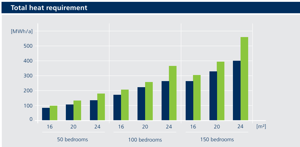
Fig. Comparison of the heating energy requirement based on the total of the hourly heat load multiplied in each case by one hour and the number of bedrooms.

It is not possible to use the recirculating air in a mixing chamber in the centralised ventilation unit, as the extract air from the bathrooms may not re-enter the supply air on account of the odours produced there.