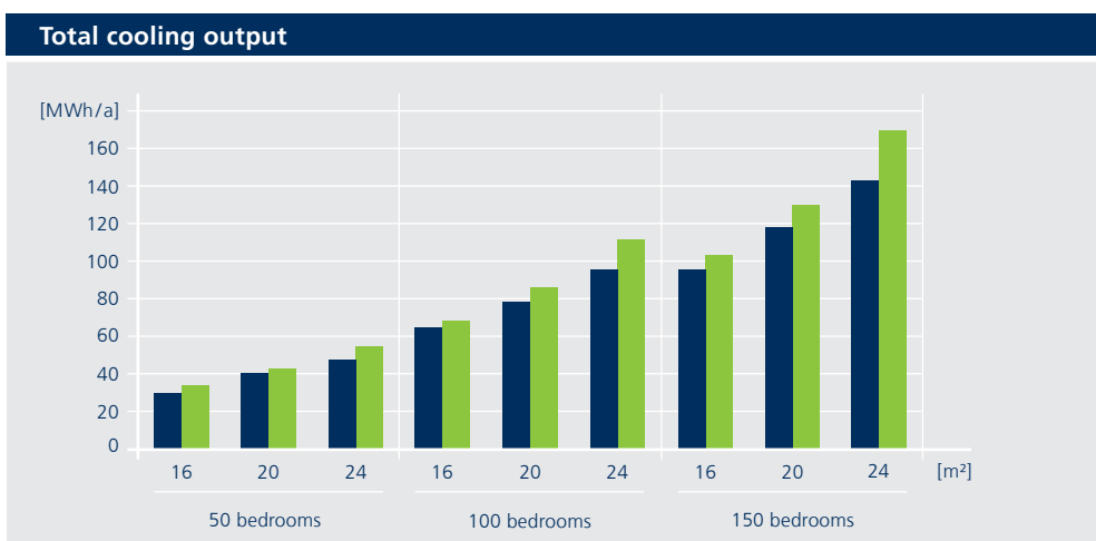
Fig. Comparison of the cooling energy requirement based on the total of the hourly cooling loads multiplied in each case by 20 hours and the number of bedrooms.

The result of the electrical energy requirement in the air handling unit is reflected in the cooling energy requirement. It was assumed that the primary air enters the room pre-conditioned. Greater cooling output from the air handling unit is fed to induction units owing to the increased air volume, regardless of whether the cooling output is actually needed. It is also possible that the outside air is cooled in the centralised ventilation unit and has to be re-heated in the room to the customer's requirement.